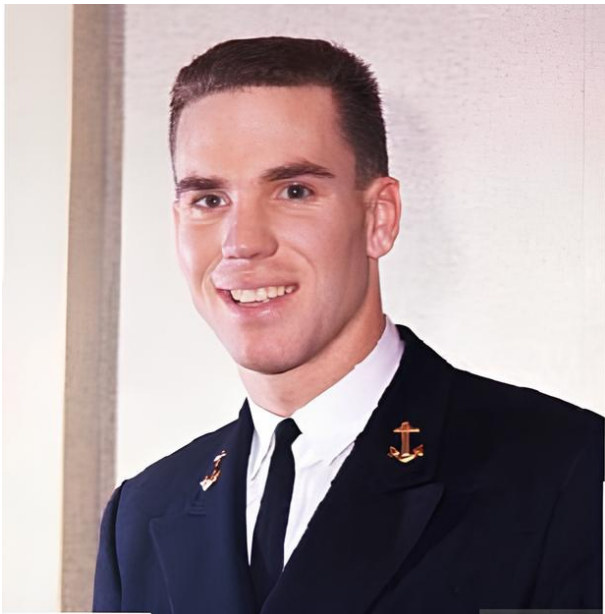
Annapolis graduate, Heisman Trophy winner, Navy officer, Super Bowl champion and American Legion baseball player Roger Staubach.