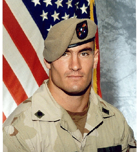
Arizona State Wildcats & Arizona Cardinals safety. US Army Corporal, Silver Star & Purple Heart decorated Pat Tillman

Vietnam. He put his football career on hold for a time, but it clearly didn't hurt his game. After his service, he joined the Dallas Cowboys and led them to two Super Bowl victories, earning the nickname "Captain America" for his on-field heroics and patriotic service. These are just a few of the many athletes whose stories intertwine with military service. They are a powerful reminder that the qualities we admire in them on the field—discipline, teamwork, courage, and a relentless work ethic—are often the very same qualities that are forged and tested in a different, more serious arena. They are heroes in more than one uniform.